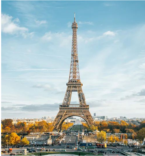
Eiffel Tower, Paris