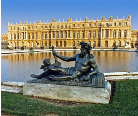
Palace of Versailles